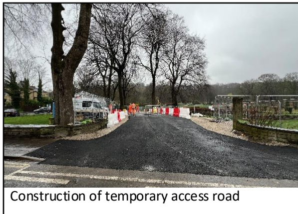
Construction of temporary access road

An Archaeological dig has taken place, revealing historic drainage and demolished mill races that would have supplied water from Clifton Beck to neighbouring mills on Oakhill Road.