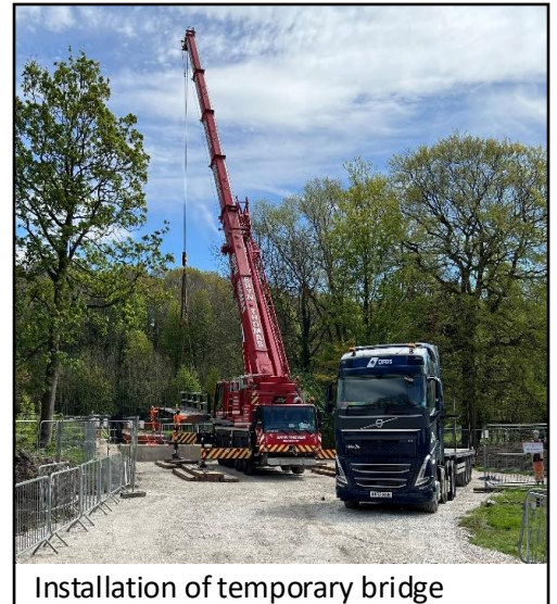
Installation of temporary bridge

A fence has been erected around the entire work area and a temporary access road constructed off Bradford Rd and across the park, which includes the installation of a temporary bridge across Clifton Beck. Protection measures have been put in place to minimise the environmental impact to the existing ground, trees and watercourse.