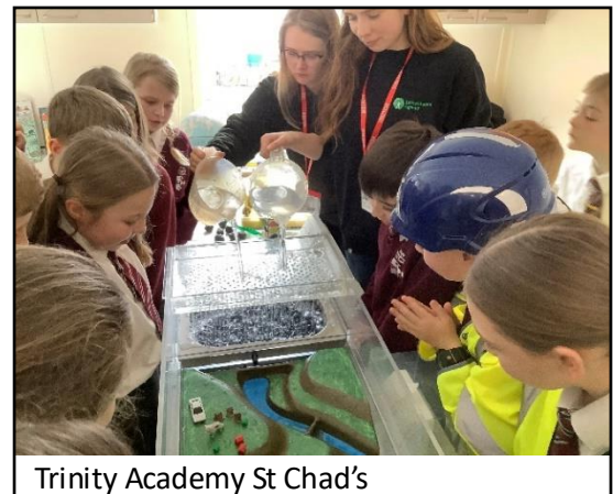
Trinity Academy St Chad's