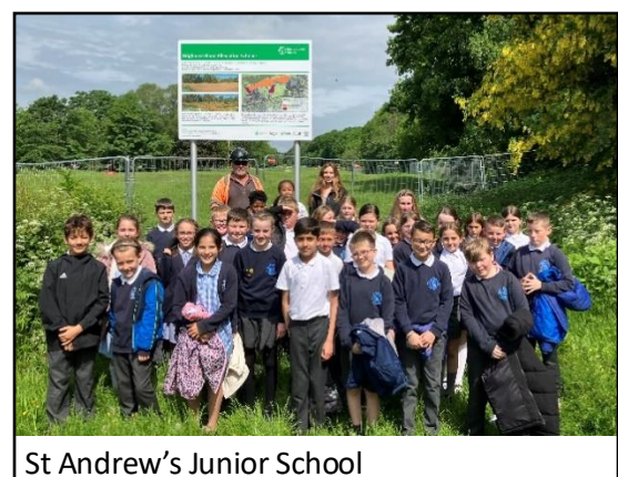
St Andrew's Junior School

For more information about the Brighouse Flood Alleviation Scheme visit www.eyeoncalderdale.com / Projects.