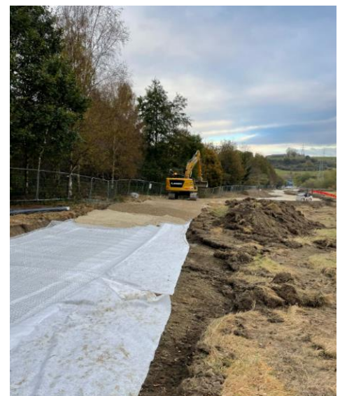
Construction of temporary access road in Whinney Hill Park

Residents may notice a period of inactivity in this area whilst the design is finalised following the preparation and investigation works. Works are due to recommence early next year.