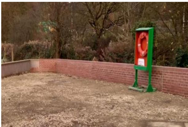
New Flood Wall at Albion Mills

The existing flood wall has been extended along the banks of Clifton Beck to the rear of Albion Mills. The existing wall has been repaired in places to provide additional resilience against flood water.