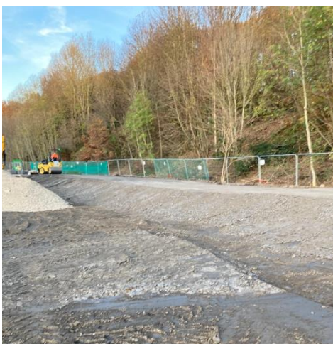
Construction of the clay embankments at Wellholme Park

New drainage trenches have been installed to take water run-off from the existing railway embankment underneath the new clay embankments and into the flood storage area. We have also completed the removal of an existing sewer manhole within the park, to prevent the manhole (which would have been positioned in the centre of the proposed flood storage area) being a point of access for flood water.