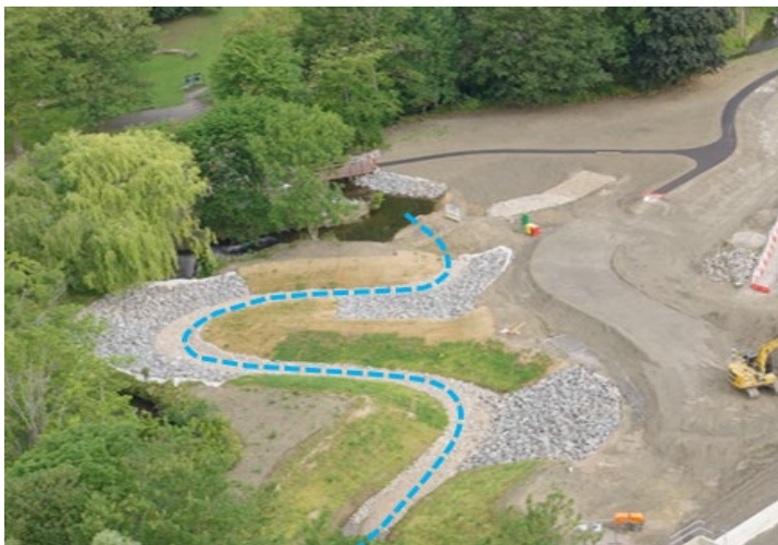
Clifton Beck Channel realignment

Work to improve some of the natural banks and by-pass the weir with a realigned channel for fish passage in Clifton Beck has been completed. This involved removing sections of the old stone wall, creating a sloped embankment in sections of the park and realignment of the beck to the eastern end of the park (indicated by the blue dashed line on the photo). The original beck channel has been partially filled in to create a backwater (where water moves slowly), although during a flood event, excess water will be able to flow along the original beck channel.