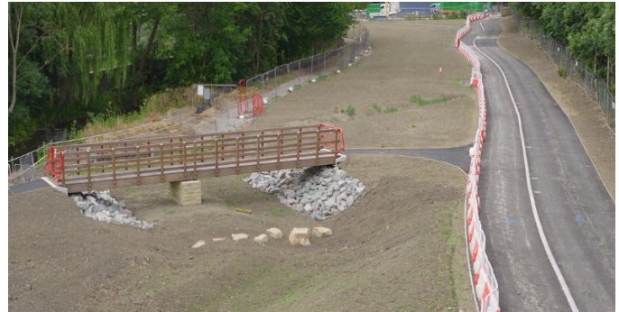
A new footbridge leading onto the foot/cycle way

Since our last update, construction work in Wellholme Park has made great progress. The new foot/cycleway has been constructed and all three new footbridges have been installed across the flood storage areas.