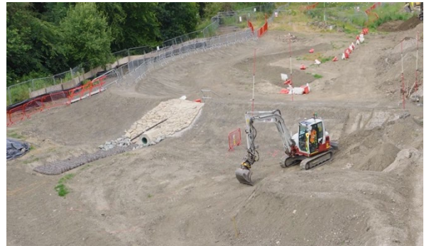
A flood embankment with culvert passing through

BAM also supported Focus4Hope, with operatives assisting with the setup of Brighthouse Gala.